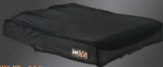
JAY® X2 – 3.8 lbs

A lightweight cushion with a JAY Flow® fluid insert provides stability and pressure relief to complement your active lifestyle.