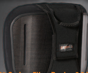
JAY J3® Carbon Fiber Back – 2.2 lbs

A lightweight cushion with a JAY Flow® fluid insert provides stability and pressure relief to complement your active lifestyle.