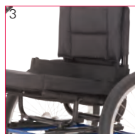
Li'l Excelerator-2 - Handcycle